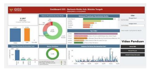
Figure 2 Dashboard OSS-RBA yeras 2022