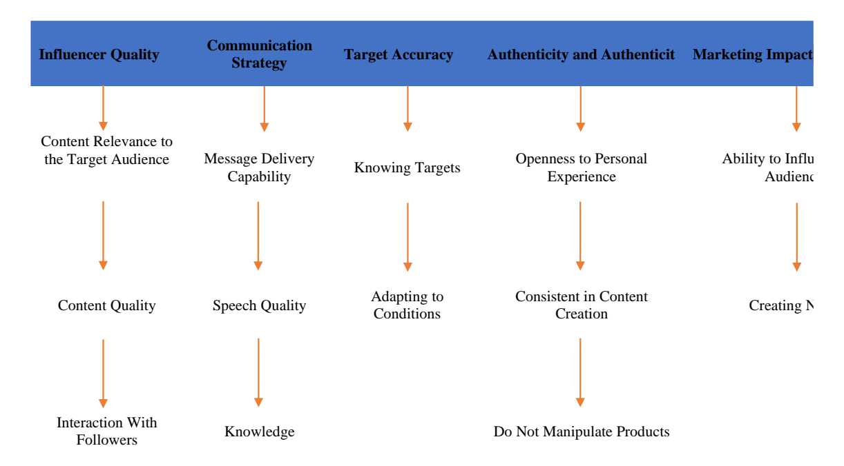
Figure 1. Model structure of attributes and factors influencing the quality of influencers in promoting products