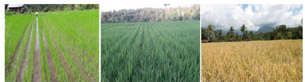
Figure 1 Cicih Gondrong rice with the planting model of Legowo 2:1

The population is all farmers participating in the Subak culture in Bali, who grow rice conventionally or organically (Lorenzen, 2015). Meanwhile, the sample is a group of farmers who were randomly selected from the population to become respondents in the study (Odoh & Nwibo, 2017). The selection of the sample must be done in a representative manner to ensure that the results of the study can be generalized to the larger population (Etikan et al., 2016).